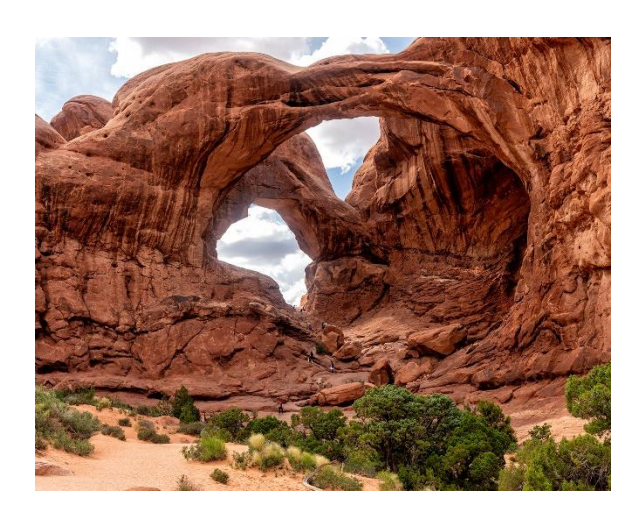
1<sup>st</sup> Place: Tim Kant Double Arch