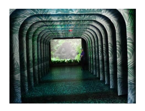
2nd Place (Tie) Sheila Hall Gorilla Show