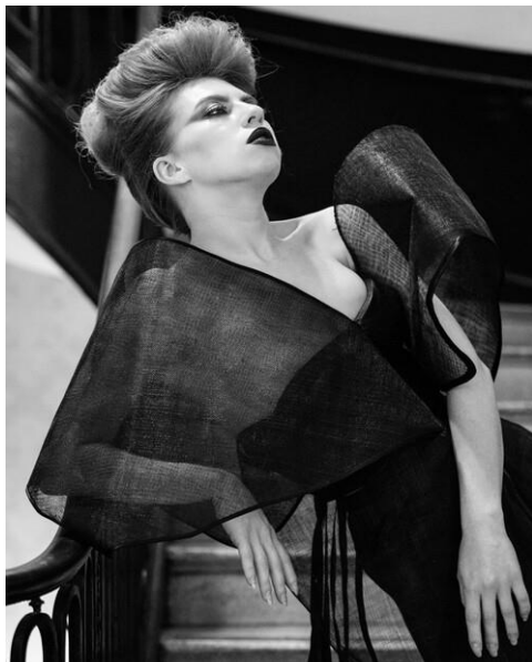
High Fashion by Kim Kurovsky

WI Chapter PSA Club Showcase - The image for the 2021 – 2022 PSA Club Showcase are here. Our seven images are: