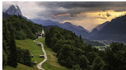
Sunset Road by Vinay Sinha