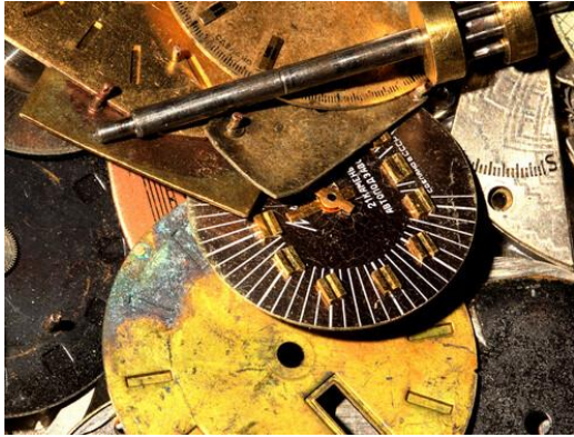
◀ 1 st Place – Ramona Lenger – Watch Parts 1