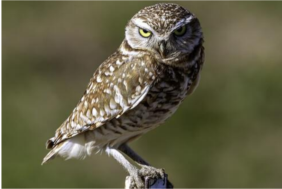
1st Place – Jyoti Sengupta – Burrowing Owl