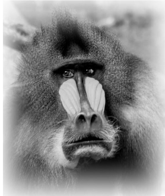
2 nd Place – Ramona Lenger – Sad Eyes