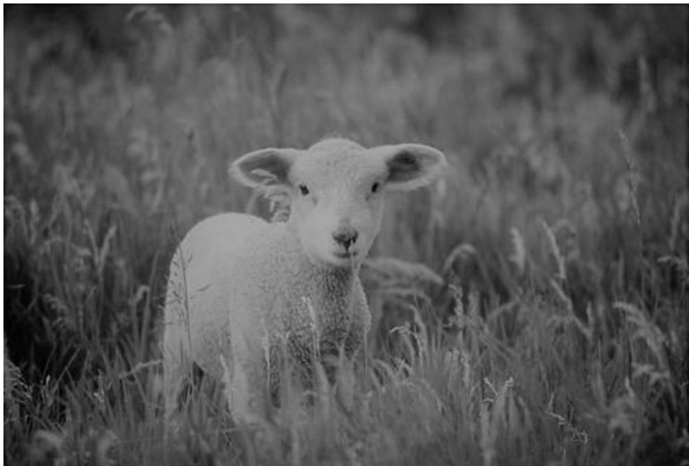
• 3 rd Place – Sheila Hall – Lamb