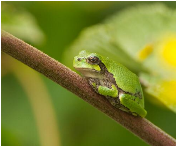
2nd Place – Ramona Lenger – Out on a Limb