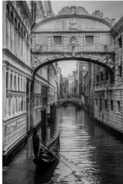
1 st Place: Vinay Sinha Bridge of Sighs