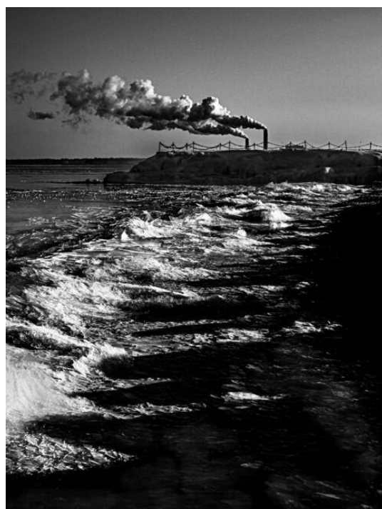
January 2nd Place: Rolling into Church by Linnea Matthiesen