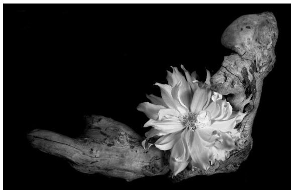
3 rd Place – Open Special Theme Dahlia – Geri Laehn

Digital Forum: Is a two hour virtual meeting hosted by Jeff Klug. The first hour is an open discussion of photography related topics. The second hour is a specific topic: