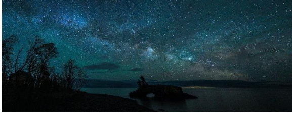
2 nd Place – Color Open Projected Hollow Rock Milkyway 2021 – Geri Laehn