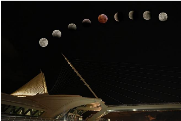
3 rd Place – Color Open Projected Eclipse – Geri Laehn