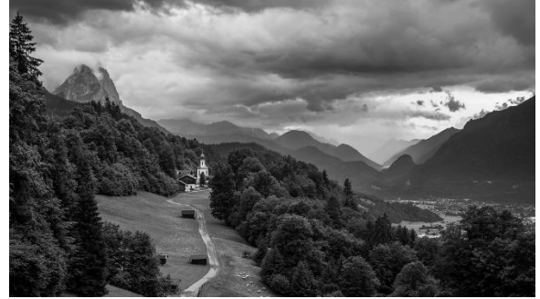
1 st Place – Mono Open Projected Road to Sky – Vinay Sinha