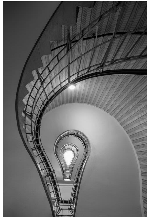
2 nd Place – Mono Open Projected Lightbulb – Vinay Sinha