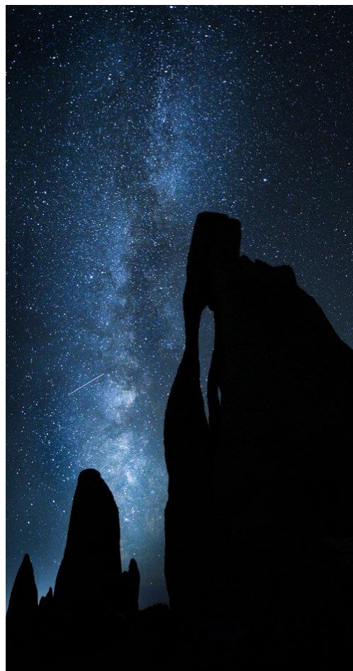
1 st Place – Color Nature Projected Needles Eye So Dakota 2021 – Geri Laehn